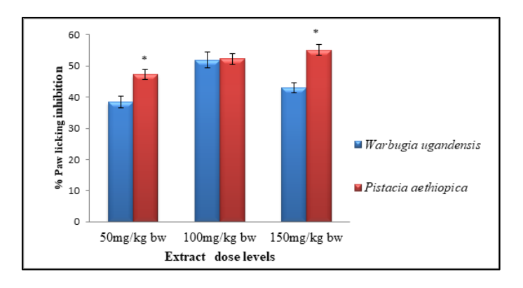
Figure 1: Comparison of paw licking inhibition of methanol extracts of P. aethiopica and W. ugandensis in the early phase of formalin-induced nociception. * indicates variation in the analgesic effect between the two plants under study (Unpaired t-test; p<0.05